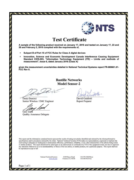
NTS Certification 100% Passive Operation