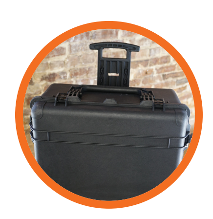
FlyAway Kit Shipping Units

Pelican 1690 x 2 Weight: 85 lbs. x 2 Dimensions: 33.4 x 28.4 x 18.2" 84.8 x 72.1 x 46.2 cm