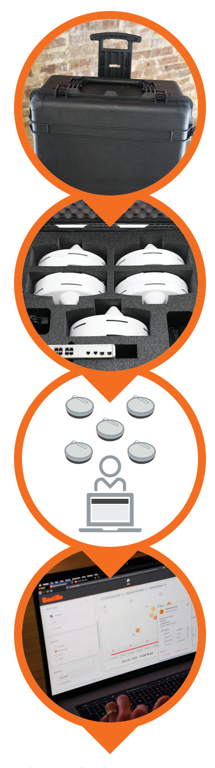
The Bastille FlyAway Kit goes from Pelican Case to Detecting and Locating first Devices in around 30 minutes.

Outside of secure facilities, government employees and military operatives may have some combination of a cell phone in their pocket, a Bluetooth Low Energy linked health monitor on their wrist, a Wi-Fi enabled tablet in their backpack and a