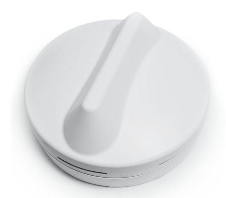
Bastill Sensor Array