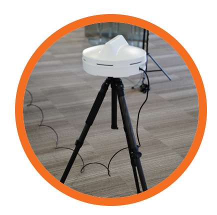
Example Sensor on a Tripod